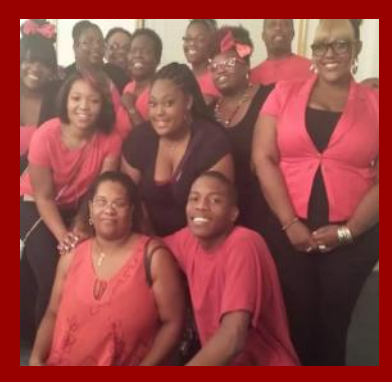
The Unified Harmonizers